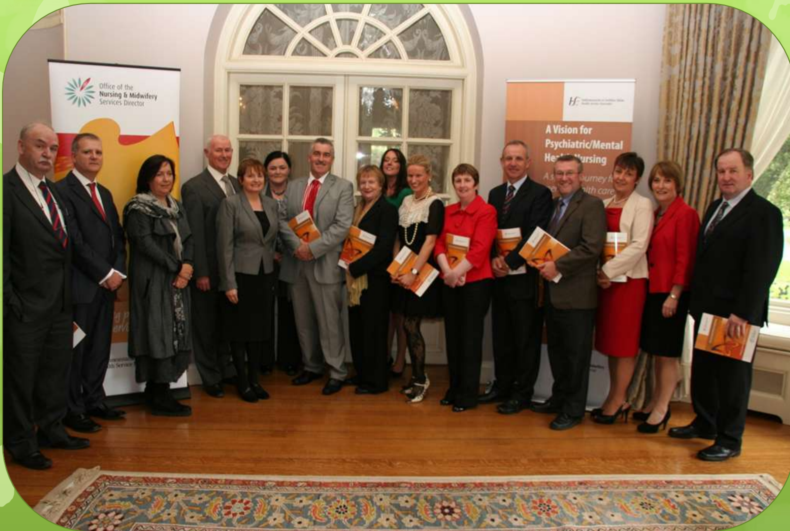
All Stakeholders in Irish Mental Health