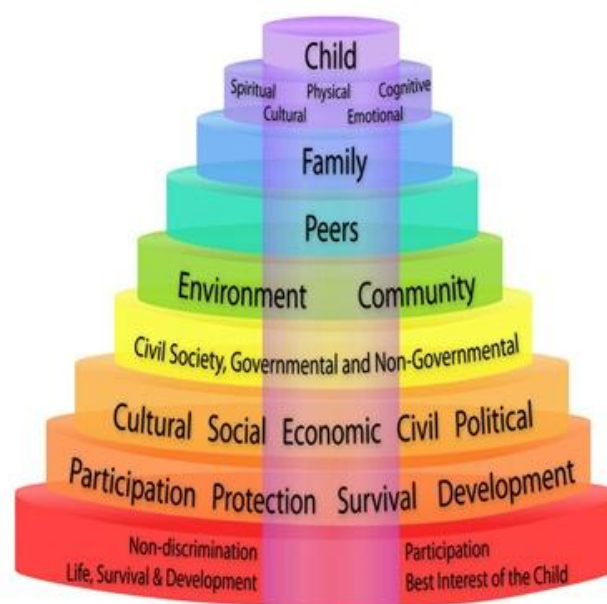
Figure 3: The Child's Rights Ecology Model

Morrison and Kirby (2010) write that it is not just the absence of risks and problems that influence children's psychological well-being but also the presence of positive factors in their lives to promote positive development. 20 While many